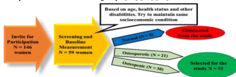
Figure 1. Summary of the recruitment strategy and allocation.

All the statistical analyses were performed by using SPSS, version 21.0 on windows 10.0 and significant level considered 0.05. At first the descriptive statistics was (mean and SD) computed for simpler interpretation of the data. Shapiro-Wilk test and Kolmogorov – Smirnov test were computed to determine the sample data has been drawn from normally distributed population or not and Levine's Test was computed for homogeneity test to determine the equal distribution of single categorical variables of the groups and found satisfactory results. Independent sample t-test was computed to find difference between the groups. OLS Multiple regression analysis (Ordinary Least Square) used to examine the independent effects of parameters on BMD with assumption of multicollinearity and autocorrelation. Receiver operating characteristics (ROC) curves used to determine the sensitivity and specificity of selected tests of two groups [10] [11] [19].